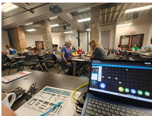
Family Bingo in full swing.

Saturday May 16th, I hosted Family Bingo. About 30 patrons showed up to win an array of fun prizes. Bingo lasted for an hour and a half and I believe everyone won at least once. Many patrons won multiple times.