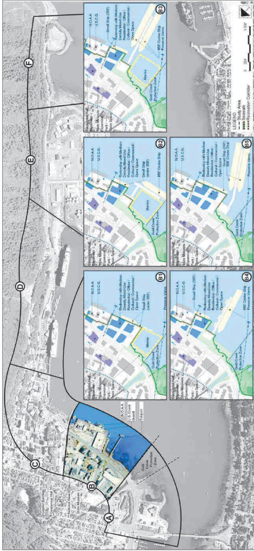
Figure 23: Area B (Subport) Alternative Concepts

Alternatives prepared for the Subport redevelopment area contemplate similar upland organization as illustrated in the Draft 2003 Subport Vicinity Revitalization Plan coupled with waterside development schemes ranging from a marina to a twin cruise ship pier. Each alternative presents a large public park and recreation area east of Gold Creek and preservation of operations found at the U.S. Coast Guard and NOAA facilities.