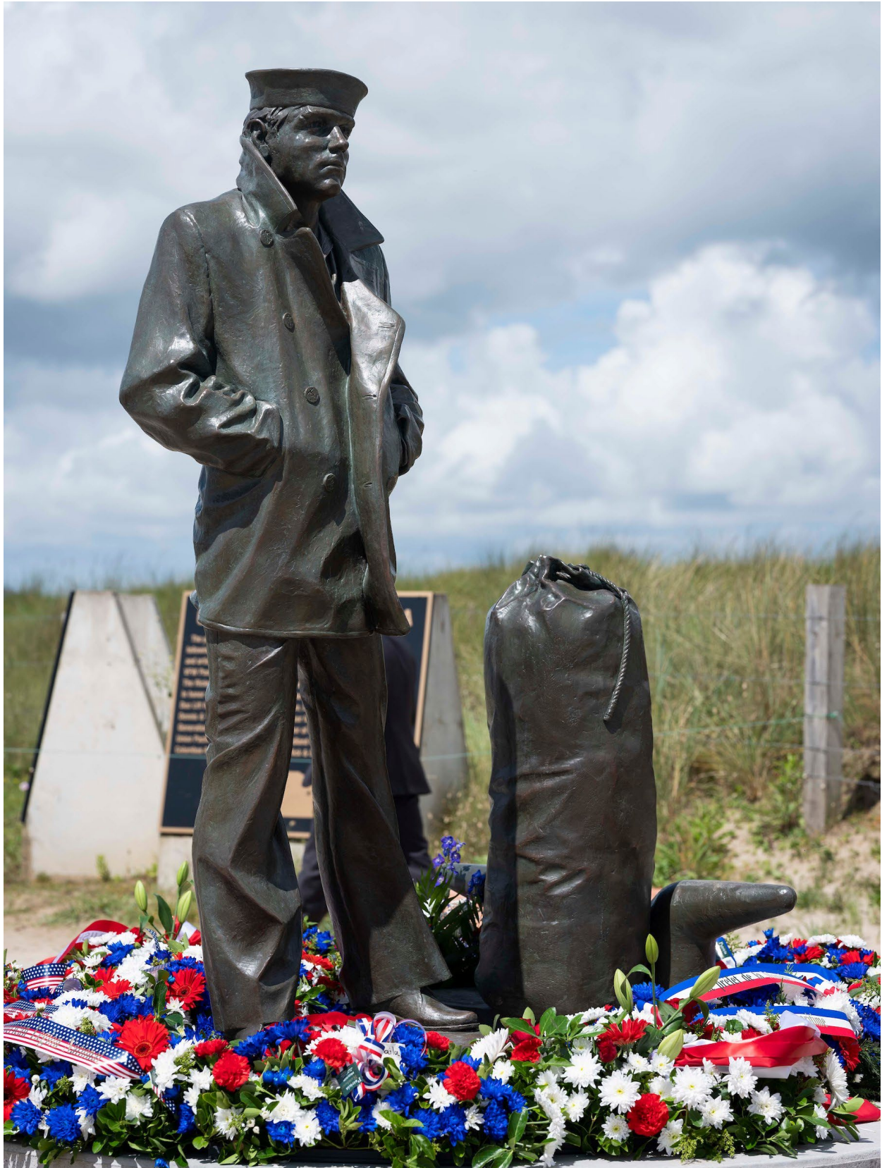
Lone Sailor Statue at Normandy Beach