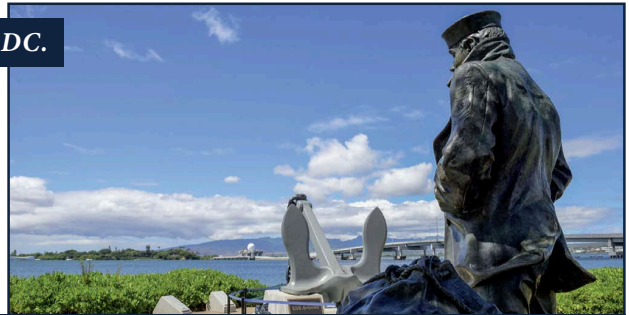
The Lone Sailor statue at the Pearl Harbor Visitor Center in Hawaii, overlooking the USS Arizona.

By placing additional Lone Sailor statues around the world, we honor, recognize and celebrate these men and women wherever they serve. In addition to the original statue in Washington, DC, 17 Lone Sailor statues have been placed around the world.