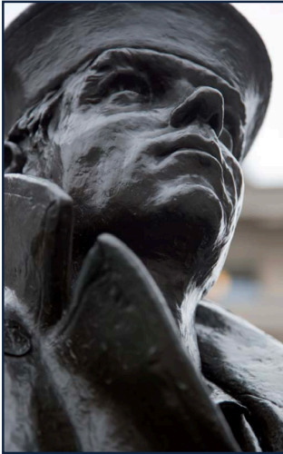
The original Lone Sailor statue stands watch in Washington, DC.

The Lone Sailor has become the iconic symbol of the men and women who have served, are serving or will serve in the Navy. He's called the Lone Sailor, yet he is hardly ever alone. He is about 25 years old, a senior second class petty officer who is fast becoming a seagoing veteran. He has done it all -- fired weapons in war, provided humanitarian assistance in far-away lands, been attacked by the enemy and defended our freedom. He has made liberty calls in great cities and tiny villages where he was a tourist, ambassador, adventurer, friend, and missionary to those less fortunate and representative of our way of life. His shipmates remember him with pride and look up to him with respect.