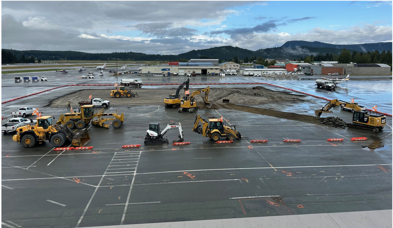
Portion of the Phase 11 work area in which the previously unknown concrete slabs and footings were found.

JNU/DOWL has issued RFP 15 – Additional Concrete Removal . This RFP asked SECON for a proposal to remove the previously unknown concrete structures that have been discovered in a portion of the Phase 11 work area within the 135 apron. Upon discovery of these structures, the project engineers determined that the structures could not remain because they represented a direct conflict with the mill and re-pave work. The initial engineer's estimate for this work was $295,300. Upon receipt of this estimate, JNU immediately advised the FAA of this differing site condition and of the initial estimated cost. The FAA was also advised that this initial estimate represented a "best-case" scenario as it was anticipated that there would be more structures unearthed within the Phase 11 work area. SECON ultimately provided a proposal for RFP 15 in the amount of $432,215.00. This proposal accurately reflected the amount of structural concrete removed, the introduction of new structural subbase and the change from mill and pave to the introduction of new asphalt paving. JNU has subsequently received and accepted SECON's proposal and this work has been determined to be AIP eligible by the FAA.