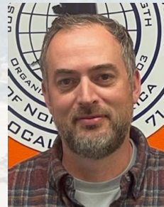
Trenton English Central Labor Council