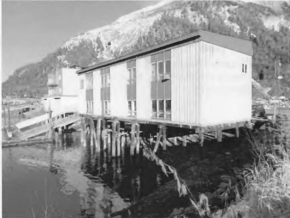
Subject as it fronts Harris Harbor (111720_226)