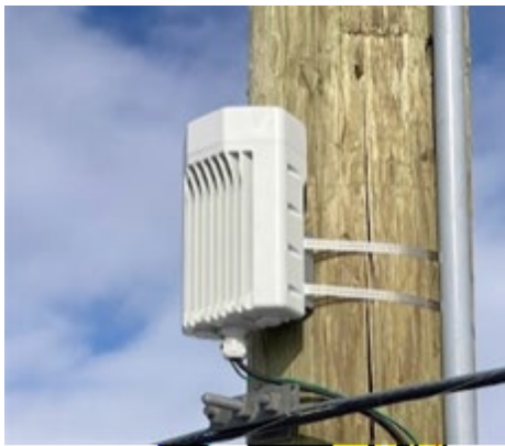
2 Example of a Wi-Fi access point mounted on a telephone pole.