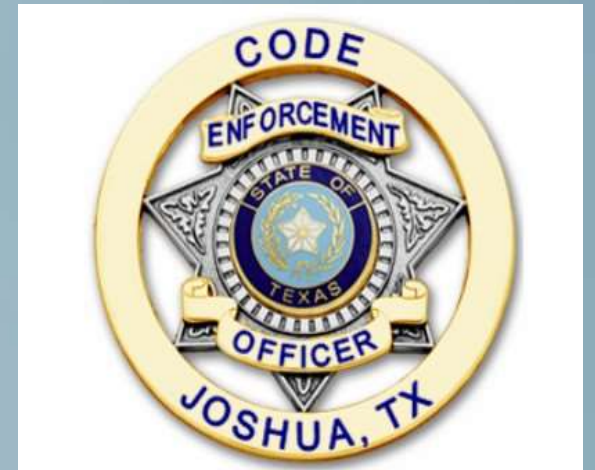
Case Information for August- 2025