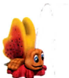
✓ BEATRICE BUTTERFLY F3023 AQUA SPOUT