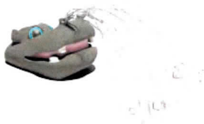
HARRY HIPPO F3030 AQUA SPOUT