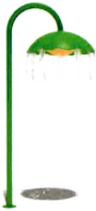
Flower Shower to replace 3 buckets