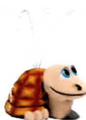
BILLY BOX TURTLE F3032 AQUA SPOUT