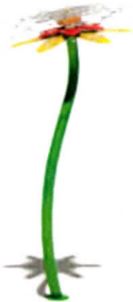
Daisy Raindrop to replace tall red sprayer