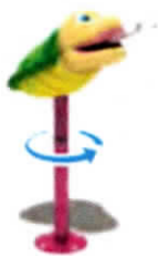
Turtle Sprayer to replace cannon sprayer