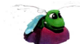
✓ DELILAH DRAGONFLY F3025 AQUA SPOUT