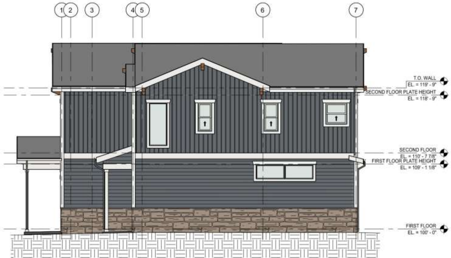
SIDE ELEVATION. 3/10" = 1'-0" (RE: 1/AD 1)