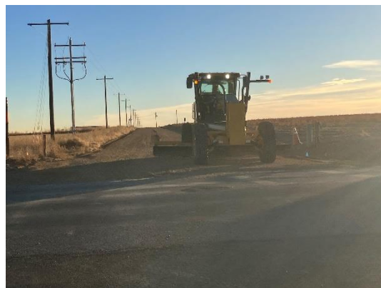
Staff training on Grader

The Community That Cares johnstown.colorado.gov