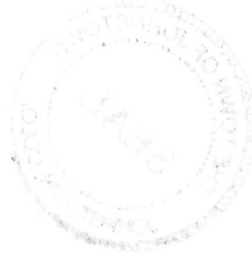
EXHIBIT A TDS BROADBAND SERVICE LLC AND THE TOWN OF JOHNSTOWN, COLORADO CABLE FRANCHISE AGREEMENT