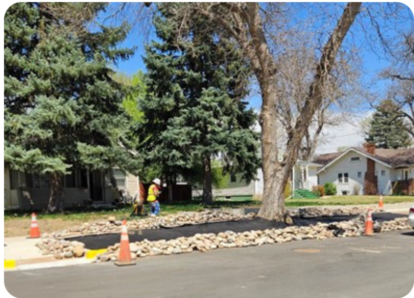
Charlotte Street Landscaping Repairs