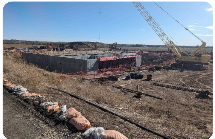
Central Wastewater Treatment Plant