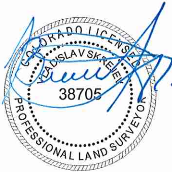
Vladislav Skrejev, PLS 38705

Said parcel contains an area of 812,289 square feet, (0.282 acres) more or less.