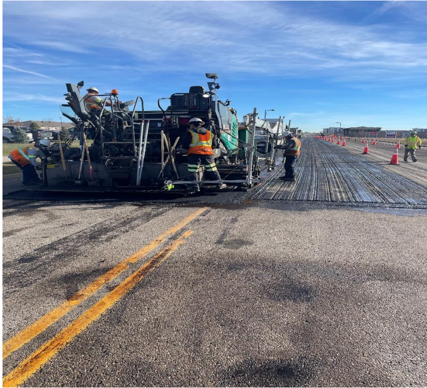
Roanald Reagan Blvd being paved.