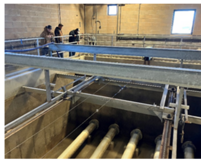
*DAF system maintenance

Water Treatment Operations are currently producing an average of 1.5 million gallons per day (MGD), which is nearly 2 million gallons more for the month than in January of last year. Staff are actively performing winter preventive maintenance on various pieces of equipment, including oil changes, gear box greasing, and basin cleanings, with a focus on the Dissolved Air Flotation (DAF) system and raw water pump stations. Additionally, this month, DAF air saturator #2 will undergo a deep cleaning process and be brought back on-line. To further improve efficiency, a new, upsized air compressor is scheduled to arrive next week for installation, enhancing the performance of the DAF pretreatment system during the busy summer months.