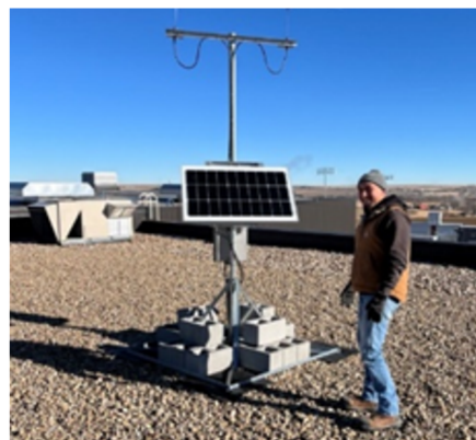
*Replacement of a DCU on Roosevelt Middle School roof