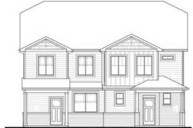
2 FRONT ELEVATION BUILDING TYPE B NTS