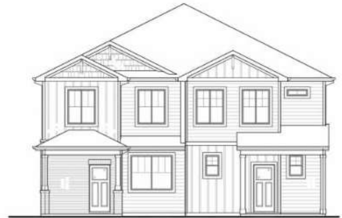
4 FRONT ELEVATION BUILDING TYPE D NTS