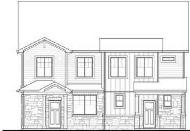
1 FRONT ELEVATION BUILDING TYPE A NTS