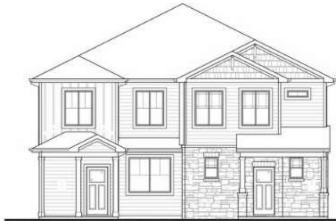
3 FRONT ELEVATION BUILDING TYPE C NTS