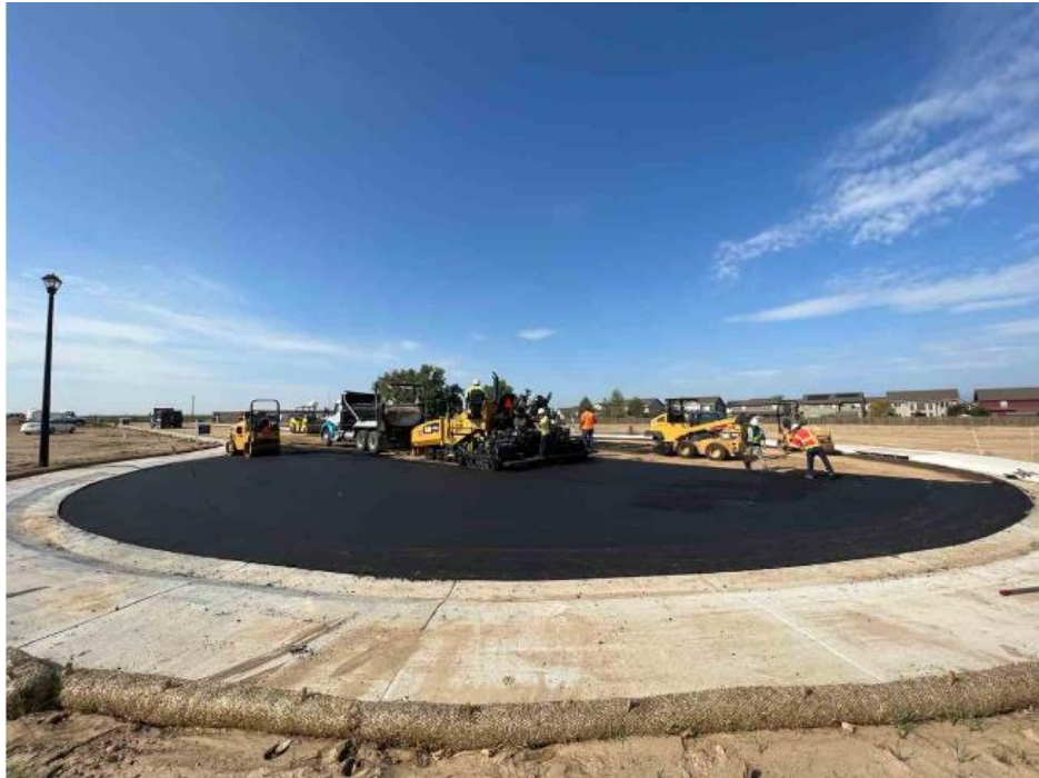
Paulter Farms Paving