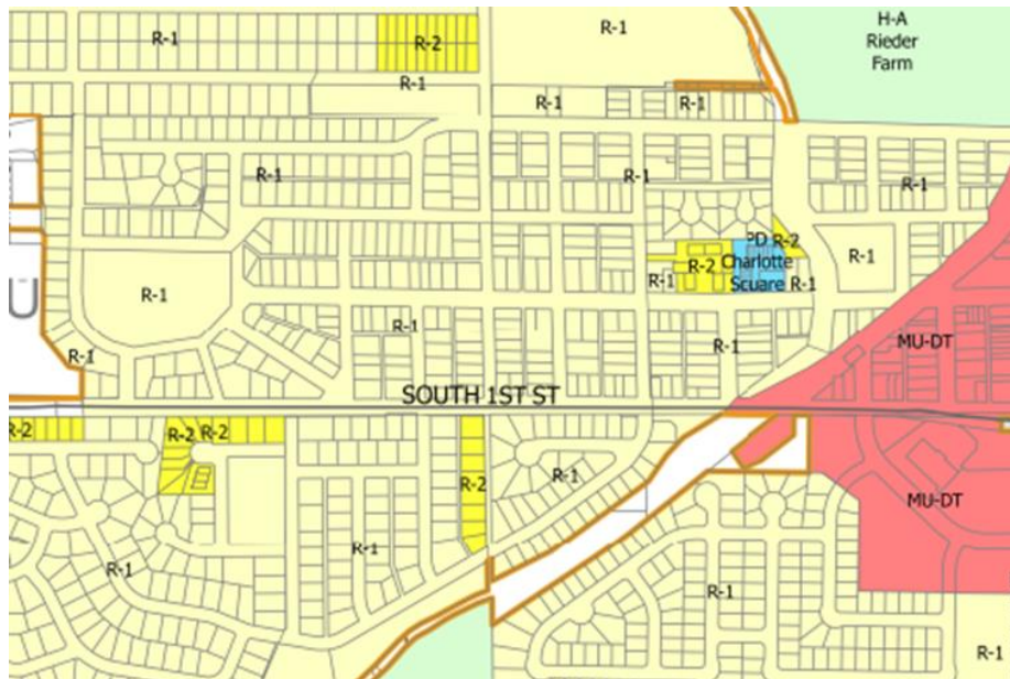
**example of the many updated maps available on the web