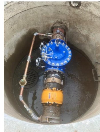
PRV (Old and New)