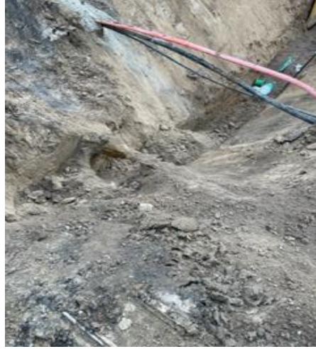
Construction crews working on underground infrastructure on Charlotte Street