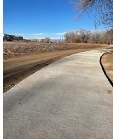
Little Thompson Trail Construction