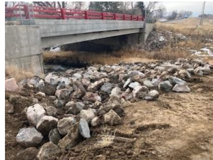
Rip Rap Installed on WCR 17 at Little Thompson River for Bridge Stabilization and Erosion Control