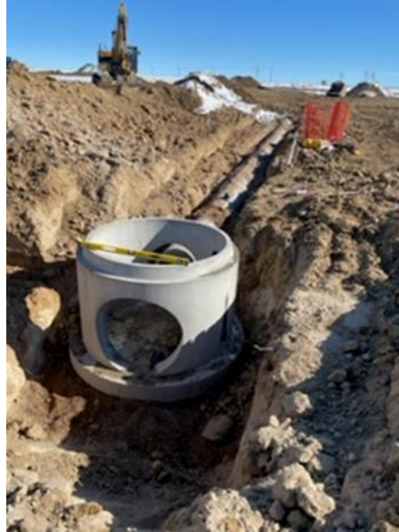
Inspection of storm Pipe at Pautler Farms