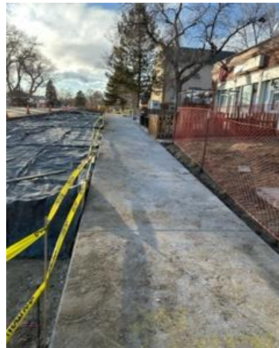
Concrete work on Charlotte Street