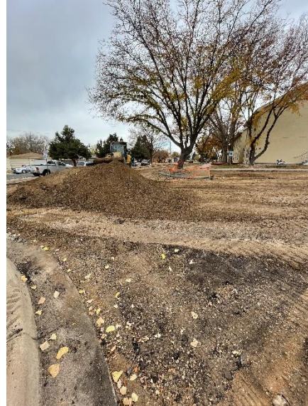
Housing Authority parking lot subgrade work