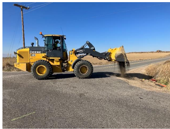
Crews filling corner of CR 50/CR13

The Community That Cares johnstown.colorado.gov