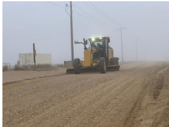
Crews grading CR 42