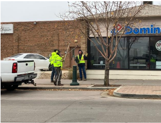
Crews installing Holiday lights