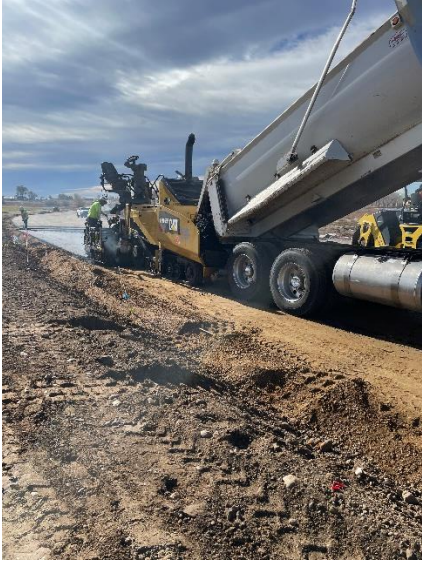
CR3 bottom mat paving