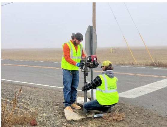
Crews replacing stop sign