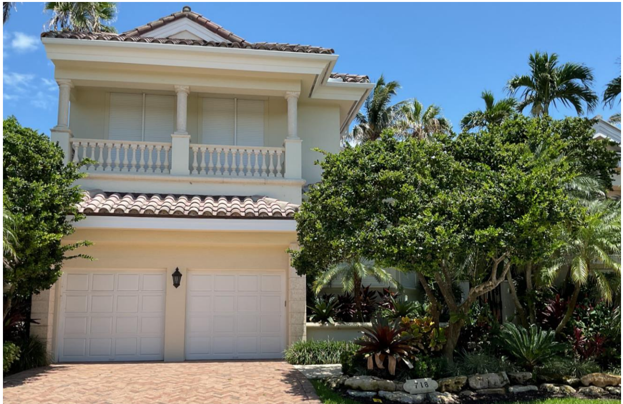
718 Ocean Drive

For the Council's review and information, Staff conducted an assessment of the residential structures within the 700's at Ocean Drive Planned Unit Development where the subject properties are located, and observed the following: