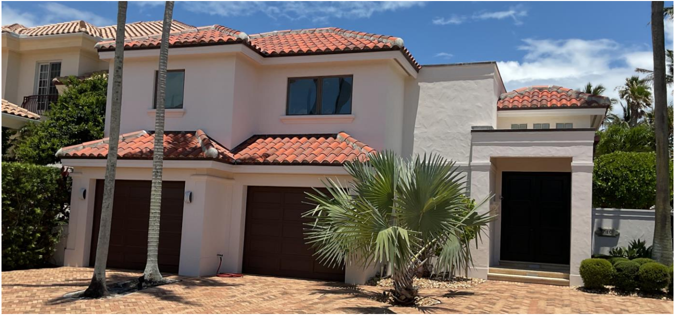
710 Ocean Drive