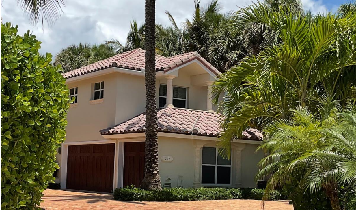
702 Ocean Drive

Using data from the Property Appraiser's Office, staff has created the following table summary for the Council's review: