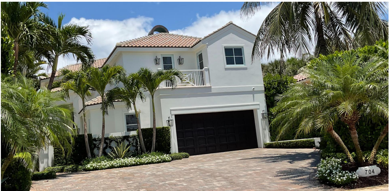
704 Ocean Drive