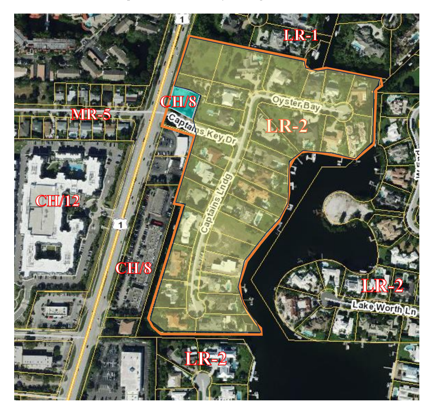
Map 2. Palm Beach County (existing) Future Land Use