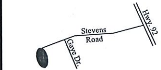
LOCATION PLAT, NTS

James M. Jett Family Trust (Book 1781, Pg. 698) ±68.5 acres remaining