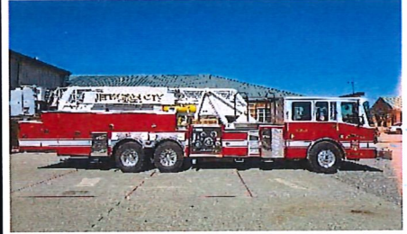
JCFD TRK 51- Aerial Ladder (2002 Ferrara Inferno) 2000 GPM Pump, 300 Gal Tank, 100' Aerial Platform