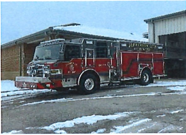
JCFD ENG 53 - Pumper (2019 Pierce Impel) 1500 GPM Pump, 750 Gal Tank