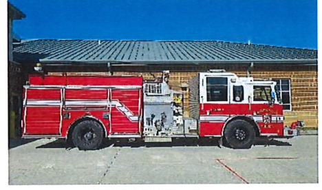
JCFD ENG 52 - Pumper (2003 Pierce Saber) 1500 PGM Pump, 1000 Gal Tank

Full Front Springs and steering box replacement.