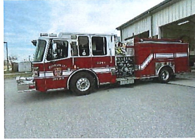
JCFD ENG 51 - Pumper (2013 Ferrara Ignitor) 1500 GPM Pump, 750 Gal Tank