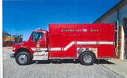
JCFD SQD 51 - Rescue (2013 Ferrara Freightliner)