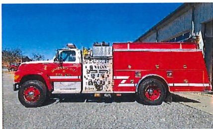
JCFD ENG 56 - Pumper (1997 KME Ford 700) 1250 GPM Pump, 1000 Gal Tank

Air Brake Diverter Valve replacement Emergency Lightbar Replacement Brake adjustment