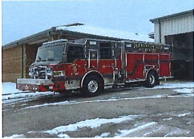
JCFD ENG 53 - Pumper (2019 Pierce Impel) 1500 GPM Pump, 750 Gal Tank