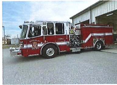
JCFD ENG 51 - Pumper (2013 Ferrara Ignitor) 1500 GPM Pump, 750 Gal Tank