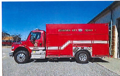
JCFD SQD 51 - Rescue (2013 Ferrara Freightliner)