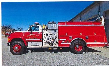
JCFD ENG 56 - Pumper (1997 KME Ford 700) 1250 GPM Pump, 1000 Gal Tank