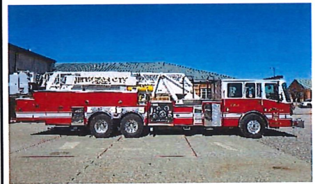
JCFD TRK 51- Aerial Ladder (2002 Ferrara Inferno) 2000 GPM Pump, 300 Gal Tank, 100' Aerial Platform