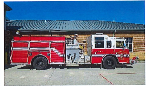
JCFD ENG 52 - Pumper (2003 Pierce Saber) 1500 PGM Pump, 1000 Gal Tank

Full Brakes/Drums Replaced Full Preventive Maint. Perform.