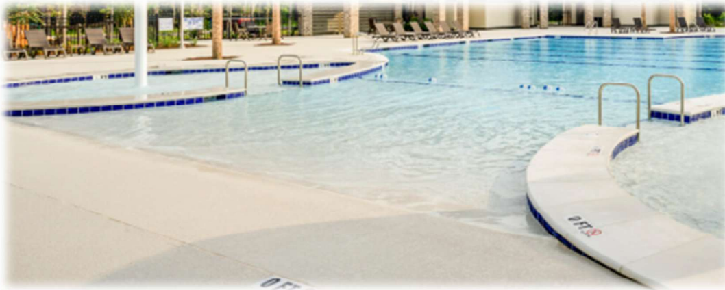
Zero entry wading area