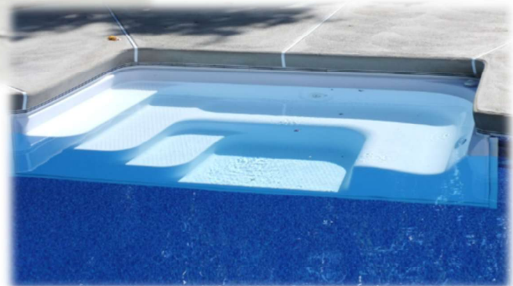
Submerged seating area