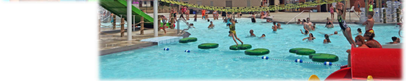
Lily pad walking area