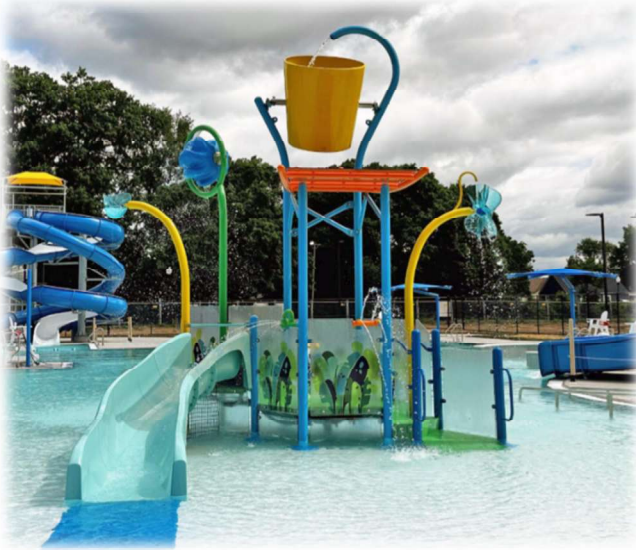
Zero depth entry aquatic play area