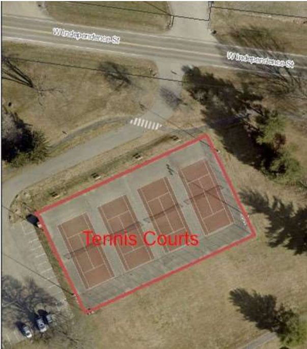
City Park Tennis Courts – Wimbledon Drive off W. Independence Street