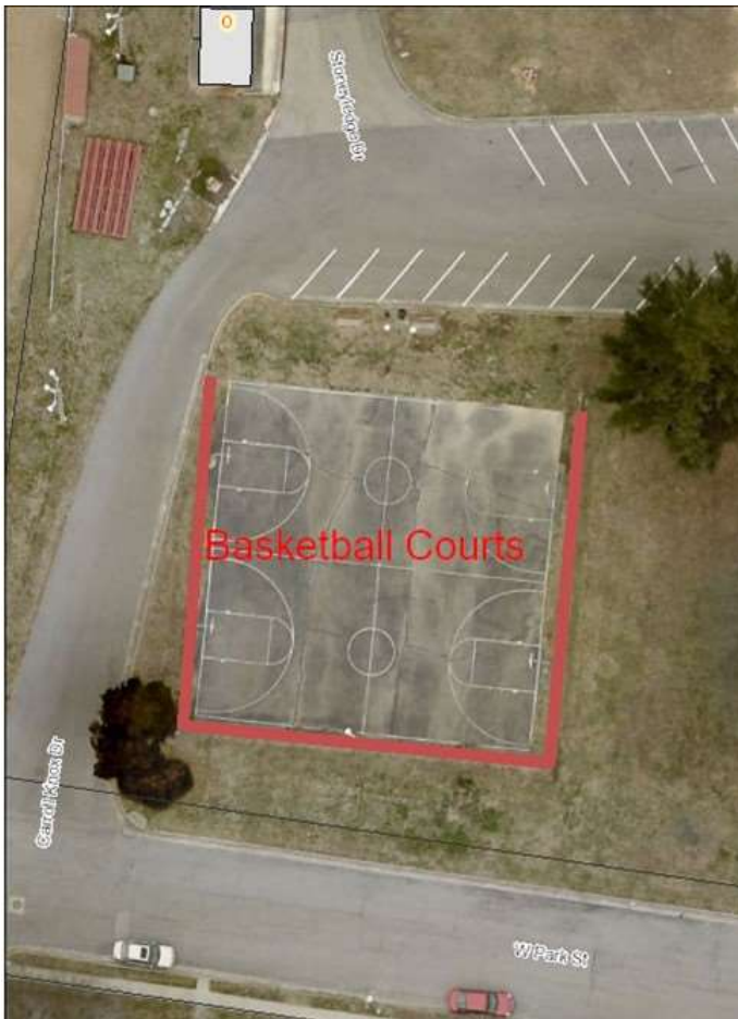
City Park Basketball Courts – Carroll Knox Drive off W. Park Street