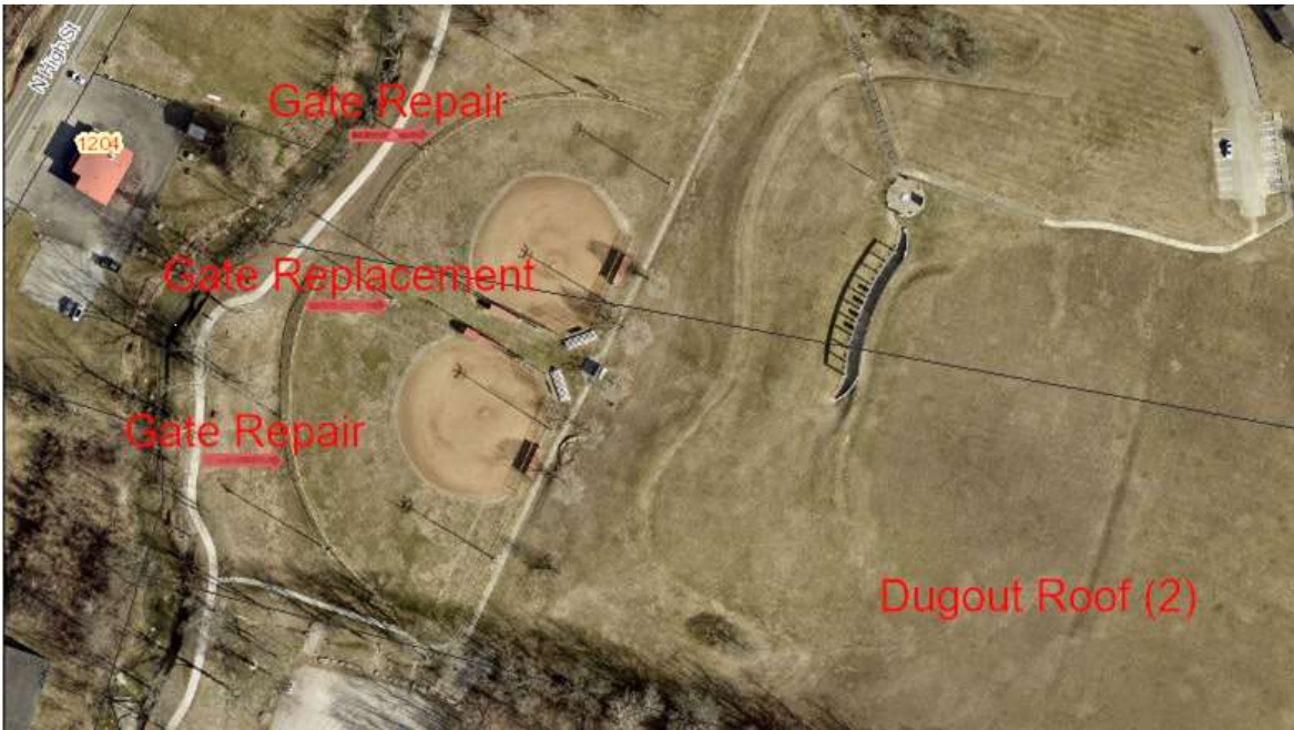
Brookside Park – Off E. Independence Street