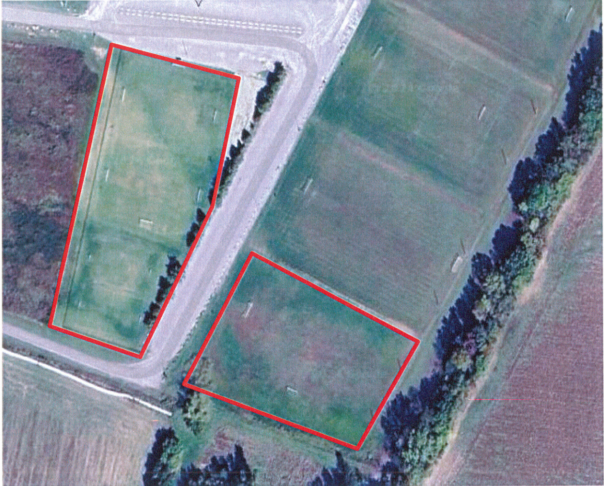
Jackson Soccer Park 2275 S. Farmington