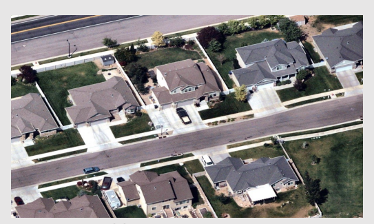
Oblique Imagery Views