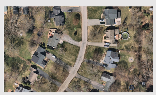
Current, Orthogonal Imagery views