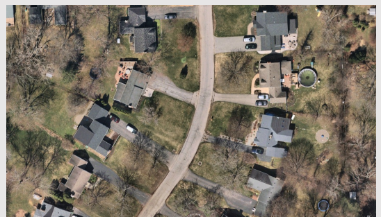
Current, HD views