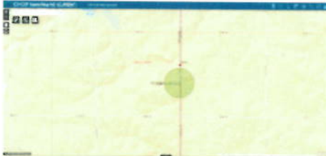
screenshot of location.PNG 1213K