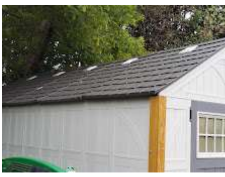
CR hail damage 2023 plastic roof and skylights.jpg 4643K