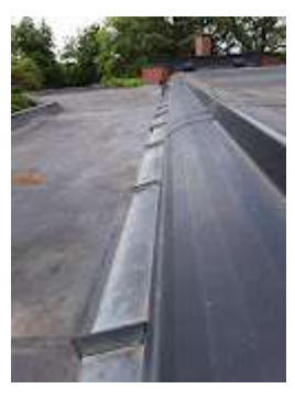
CR hail damage 2023 dents in copper edging.jpg 69K