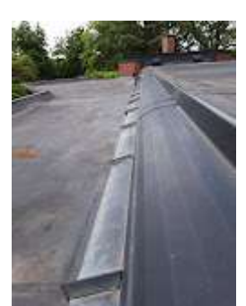
CR hail damage 2023 dents in copper edging.jpg 69K