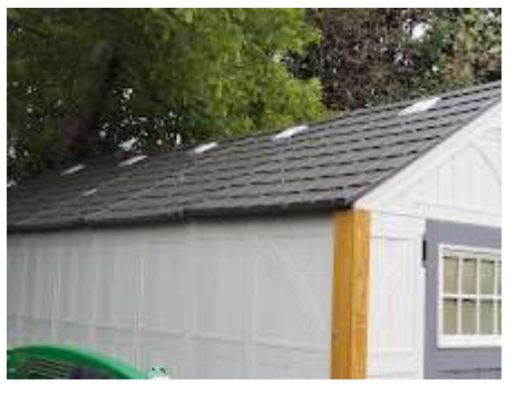
CR hail damage 2023 plastic roof and skylights.jpg 4643K