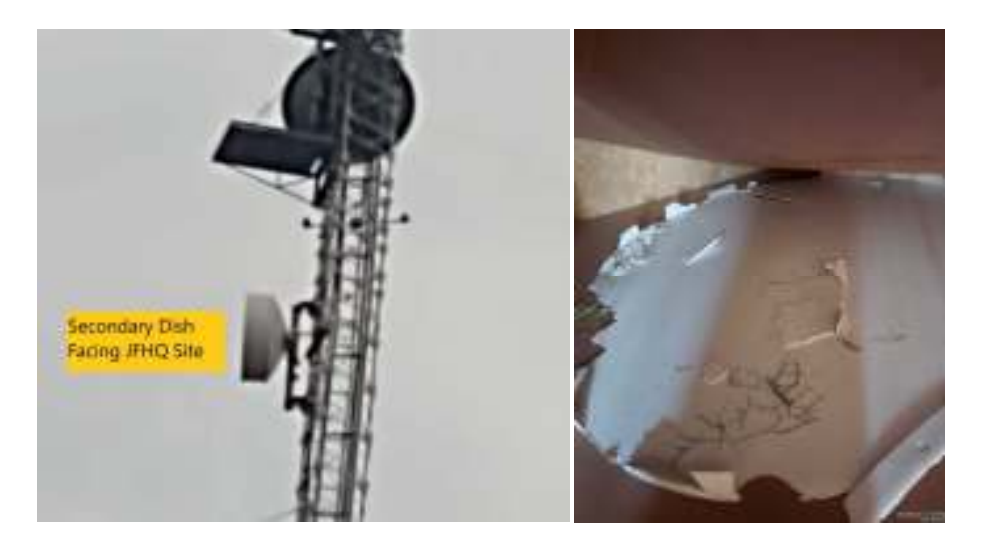
Facing JFHQ Site

1 of the dishes on the tower sustained damage from the storm. This is the secondary 4ft dish facing the JFHQ site.