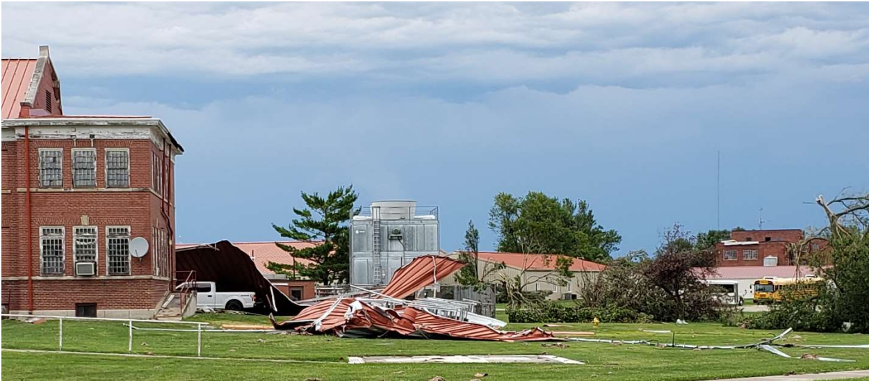
Linden Court Roof