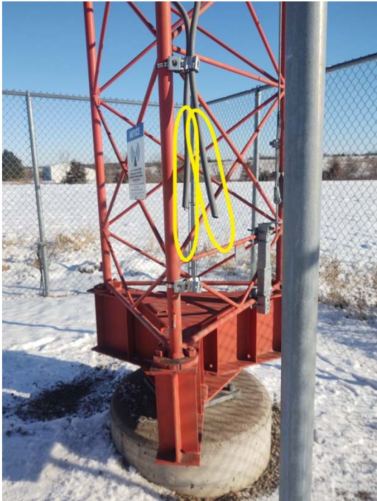
Tower Ground Bar after Repair