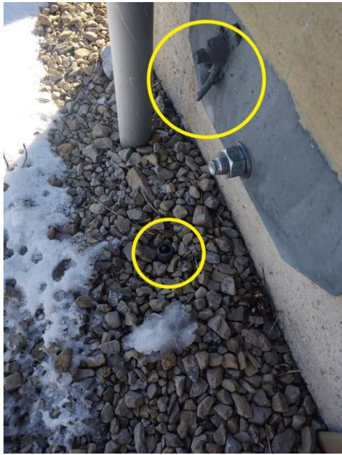
Shelter SE Corner after Repair