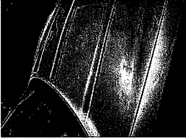
hail damage 1.jpg 2444K