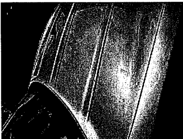
hail damage 1.jpg 2444K