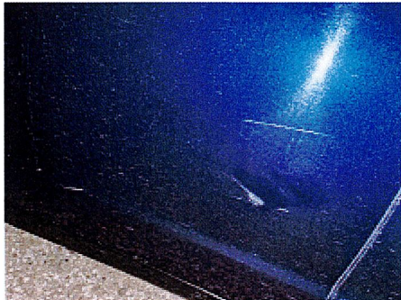
IMG_0042 (1).jpeg 4207K