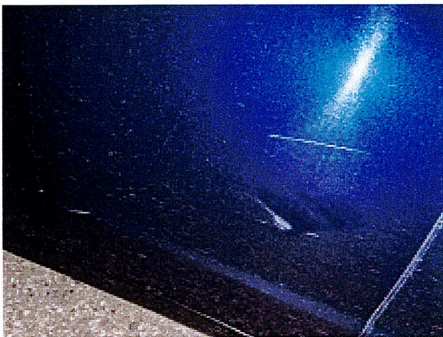
IMG_0042 (1).jpeg 4207K