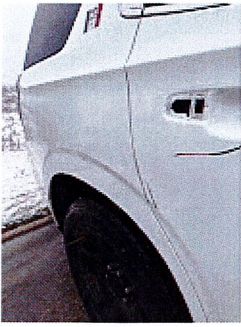
Hardin 3-19-25 #4.jpg 56K