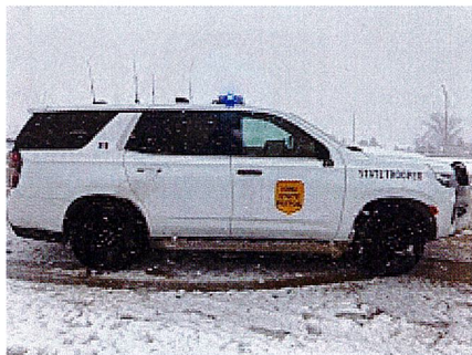
Hardin 3-19-25 #2.jpg 70K