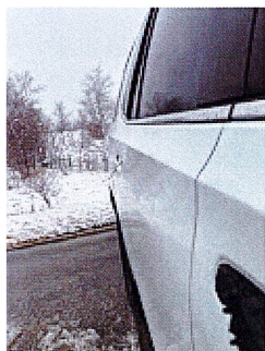
Hardin 3-19-25 #3.jpg 64K