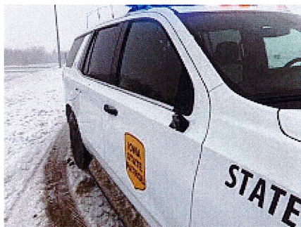
Hardin 3-19-25 #1.jpg 63K