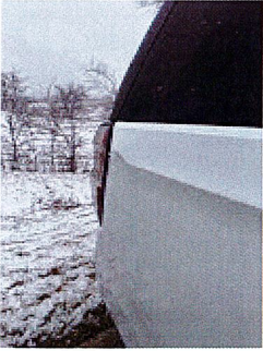
Hardin 3-19-25 #5.jpg 62K