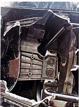
2/17/2025 Comments: RT HEADLAMP Replace hlamp bracket behing hlamp mount point