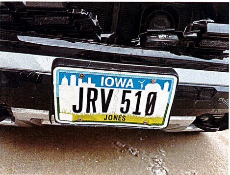
2/17/2025 Comments: LICENSE BRACKET