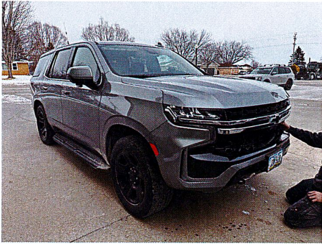
2/17/2025 Comments: RF