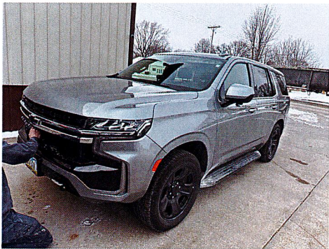
2/17/2025 Comments: LF