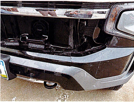
2/17/2025 Comments: replace lower cover