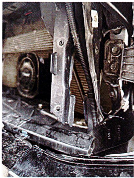
2/17/2025 Comments: FRONT PANEL