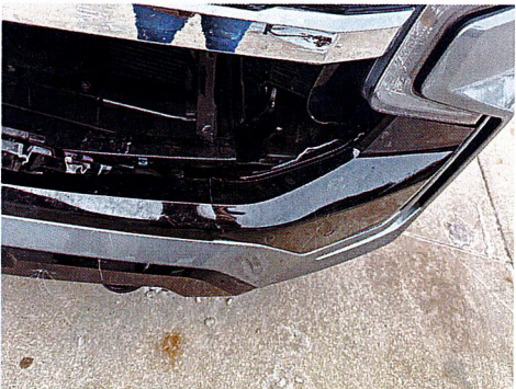
2/17/2025 Comments: LOWER BUMPER