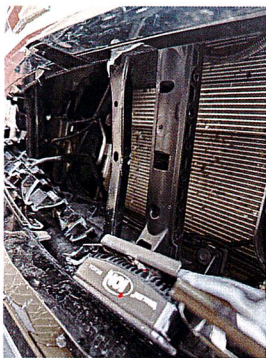
2/17/2025 Comments: STIFFENER