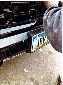
2/17/2025 Comments: REPAIR UPPER COVER