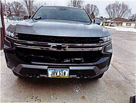
2/17/2025 Comments: FRONT