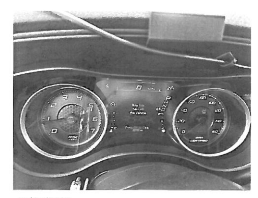
11/24/2023 Comments: MILEAGE