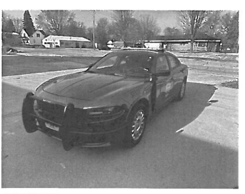
11/24/2023 Comments: LF