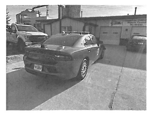
11/24/2023 Comments: RR