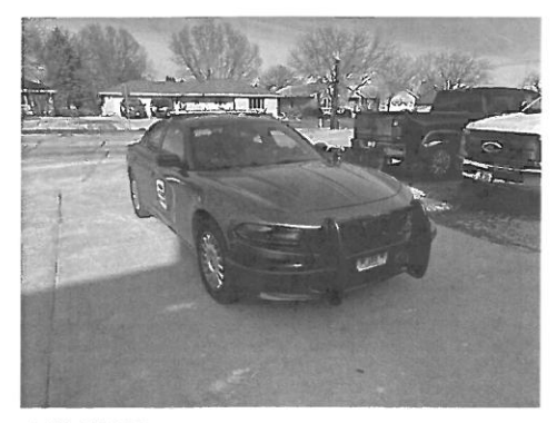
11/24/2023 Comments: RF