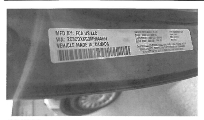
11/24/2023 Comments: VINTAG