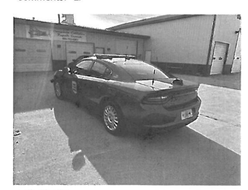
11/24/2023 Comments: LR