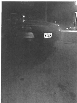
Pic #1.jpg 1822K