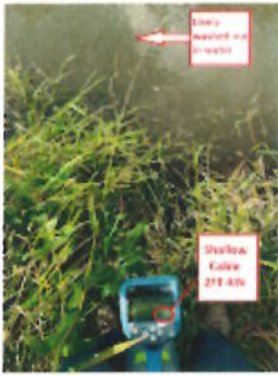
Shallow Cable.jpg 440K