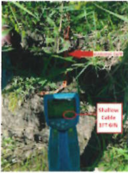
Exposed Warning Tape.jpg 486K