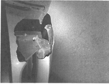
469 2.jpg 113K