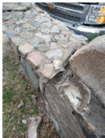
Black Hawk Rock Wall_rock.JPG 327K