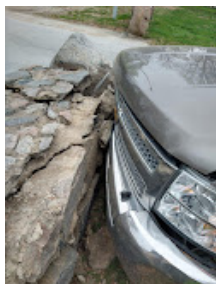
Black Hawk Rock Wall_Topview.JPG 252K