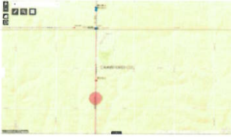
Screenshot .png 1215K