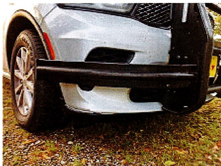
#81 Damage Photo 1 9-18-25.JPG 3919K