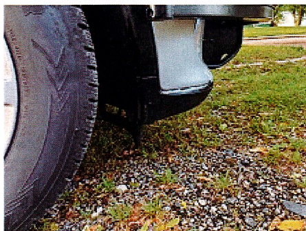
#81 Damage Photo 2 9-18-25.JPG 4000K