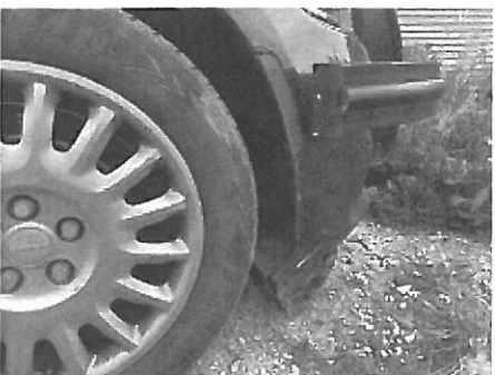
RF bumper.jpg 4544K