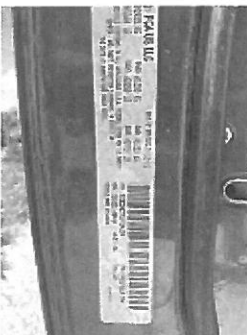
Vin info.jpg 4772K