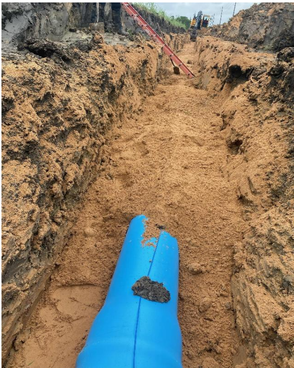
Figure 1: Installation of Waterline at STA 25+19.80