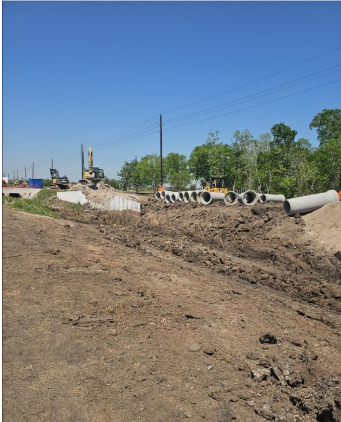
Figure 1: Demolition of existing bridge and Installation of storm sewer