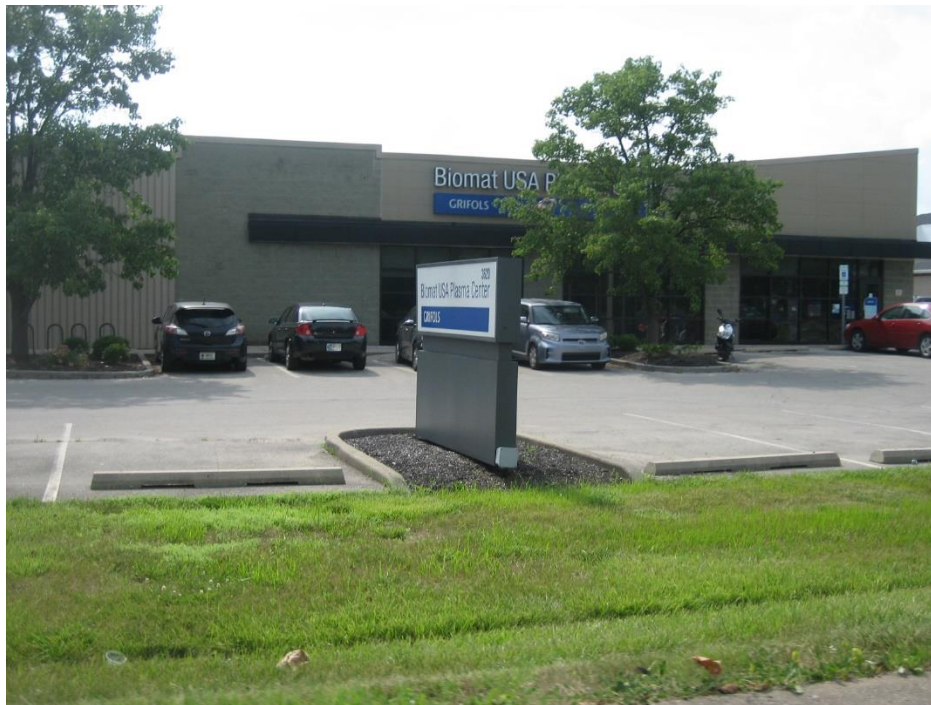
Existing outlot development to the south with one freestanding sign, looking west.