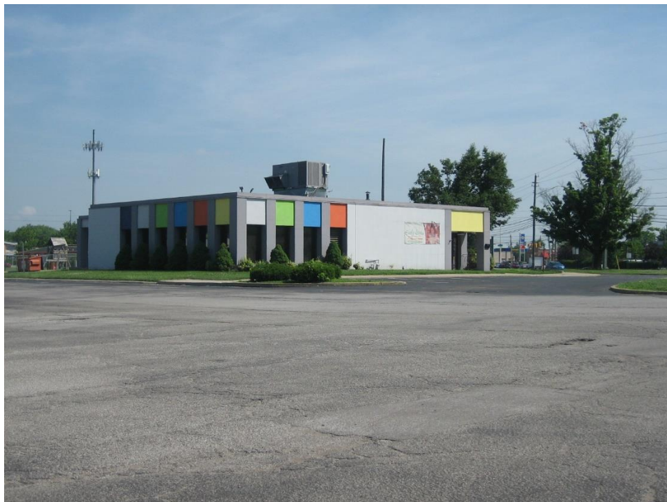
Existing outlot development to the north with one freestanding sign