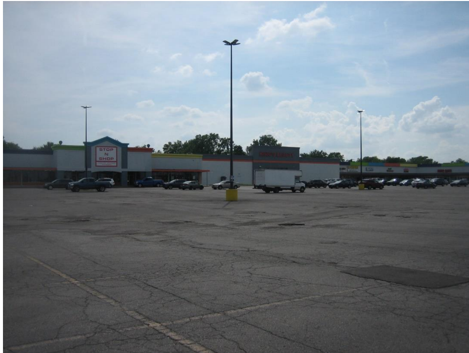
Adjacent integrated commercial development, looking west.