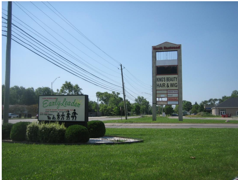
Existing frontage signs, with 100 feet and ten feet of separation from proposed sign, looking south