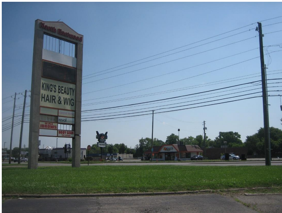
Approximate proposed sign location, five feet in front of existing center sign, looking northeast.