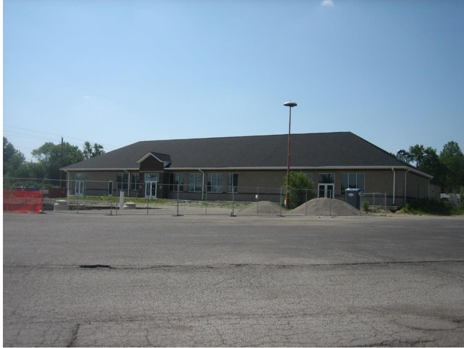
Subject site commercial gas station under construction, looking south.