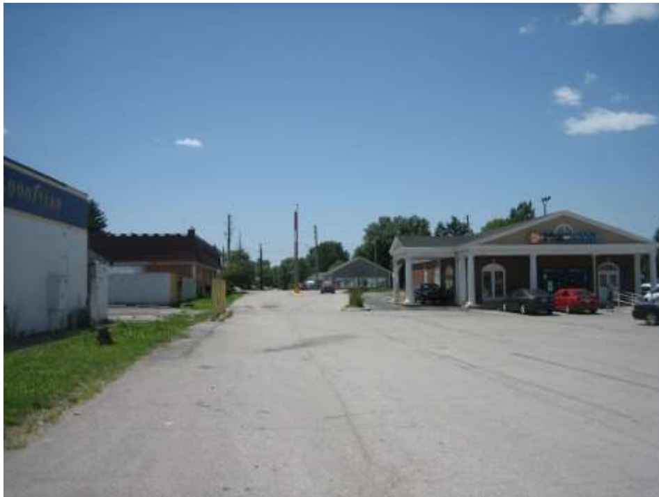
Subject site primary entry from South High School Road via an easement through the adjacent commercial retail parking lot, looking west.