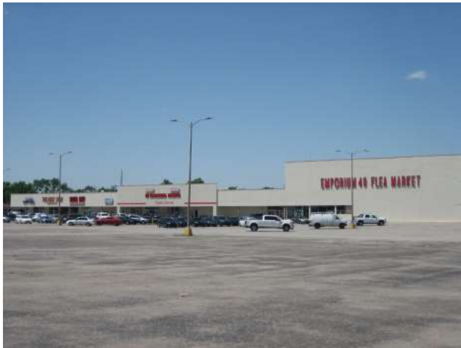
Adjacent commercial retail intergaged center, looking north.