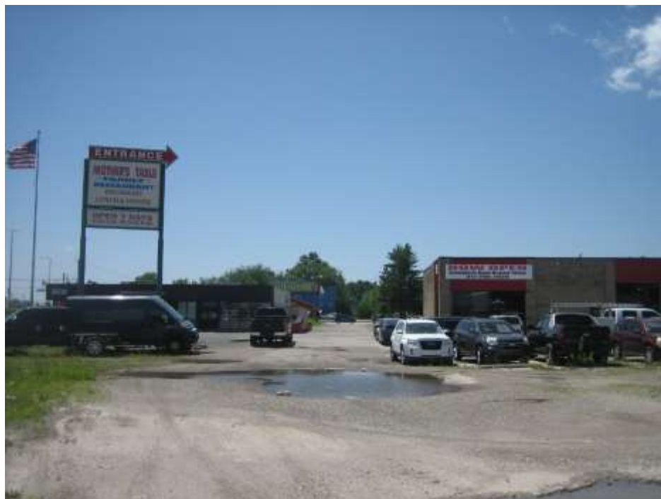
Adjacent commercial retail, looking west.