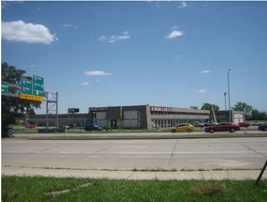
Adjacent commercial motel, pre-dating the TOD, looking south.