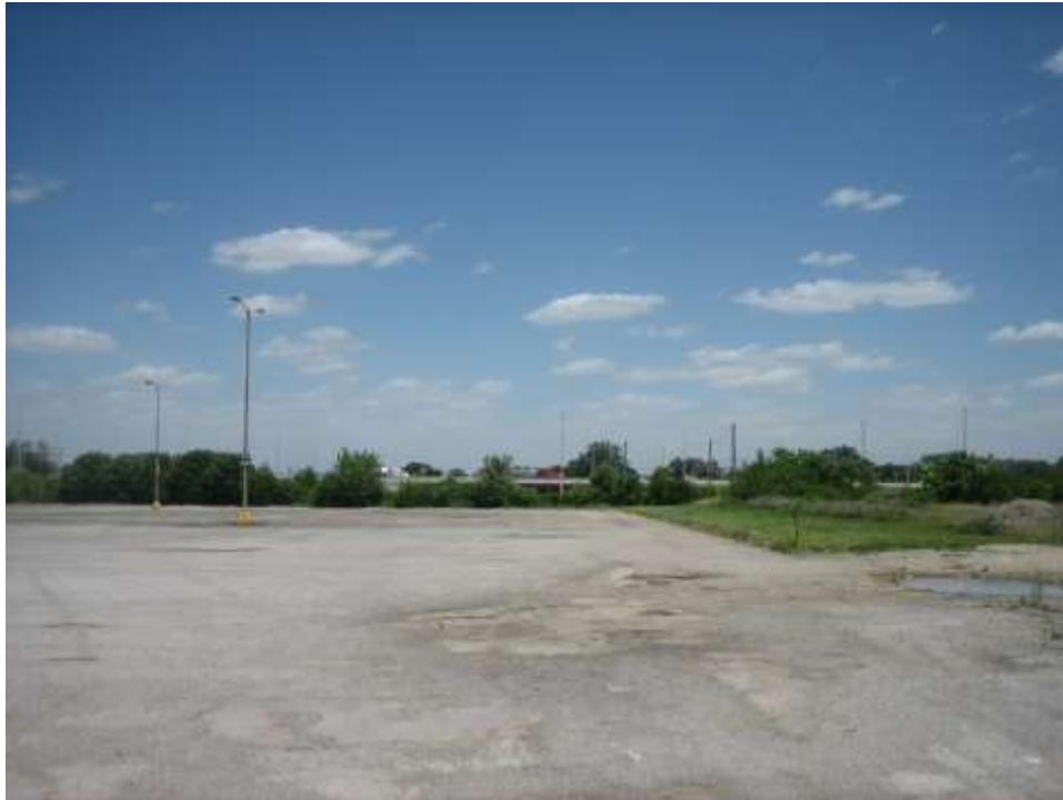
Subject site, proposed parking lot area, looking east