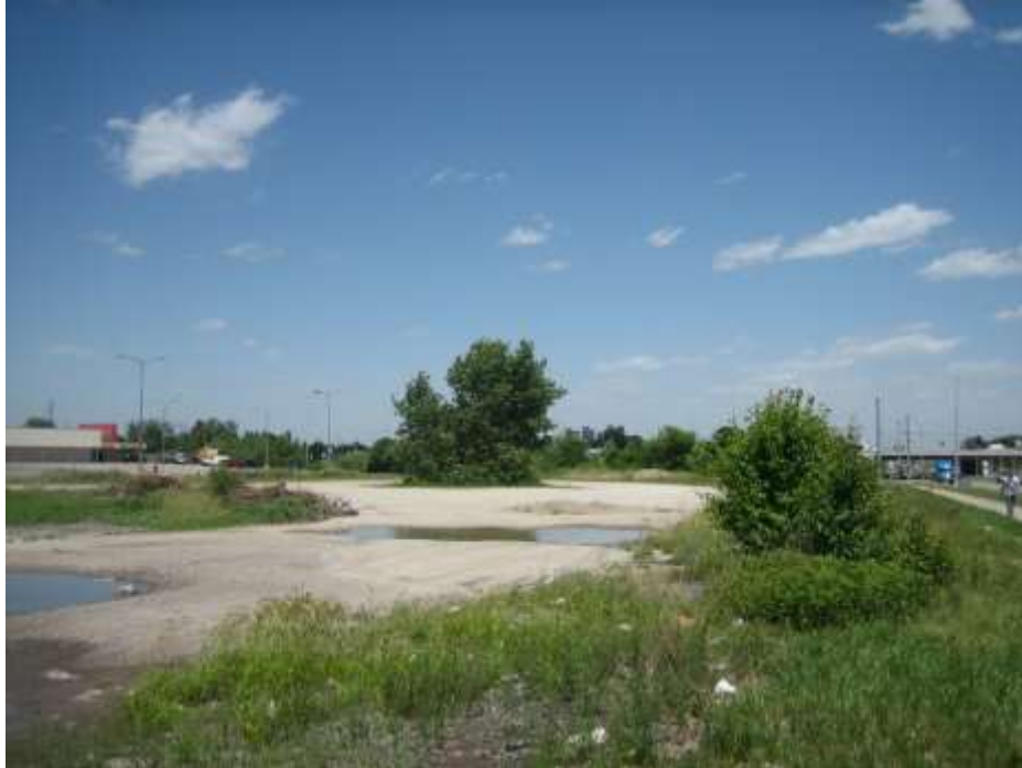
Subject site West Washington Street frontage, looking east.