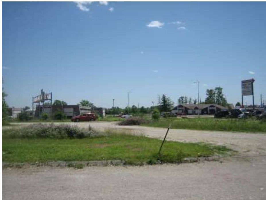
Subject site, looking south towards West Washington Street.