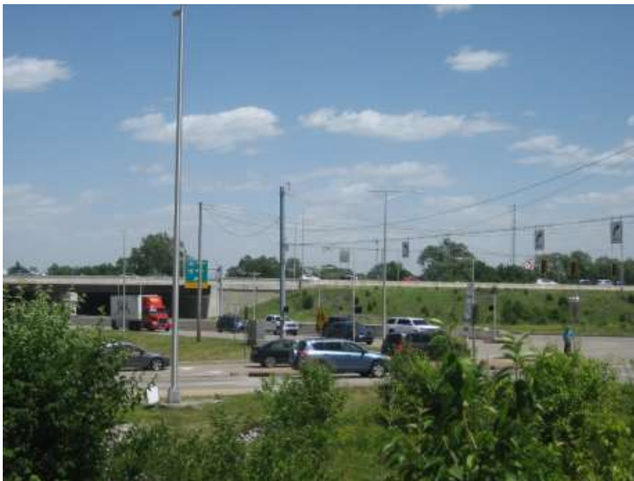
Adjacent I-465 interstate interchange, looking east.